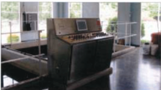
Images starting top right, going clockwise: 1) Rosely Road Tank, holding as much as 1.3 million gallons. 2) Filter and Pump control panel in their filter plant. 3) Straub Brewery Plant. G. Cowles

FIND IT. SERVICE IT. DOCUMENT IT. BOOST PRODUCTIVITY.